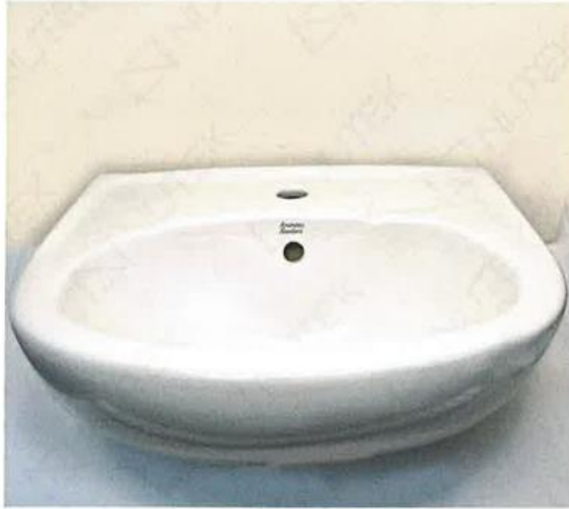
Figure 2 - Body marking